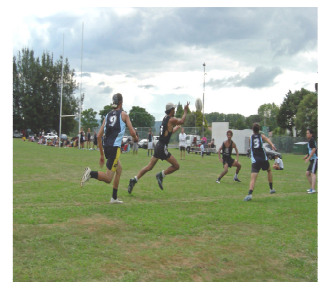
Hamua Maidens attack the Ngahina Souljahz try-line in the battle for Ruatoki's top marae

B Grade winners were Te Poho o Te Rangimonoa No1. who ended with a tie-breaker shoot out try against Otarahiioi in a tight final game.