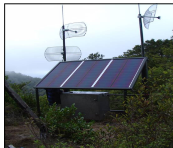
Solar Tower @ Tawhiuau beams wireless broadband to Te Urewera.

develop the Tuhoe.com wireless network and last year TEA secured funding to help provide service to all 14 Tuhoe kura over time.