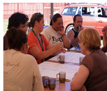
Kaiako from across the rohe.